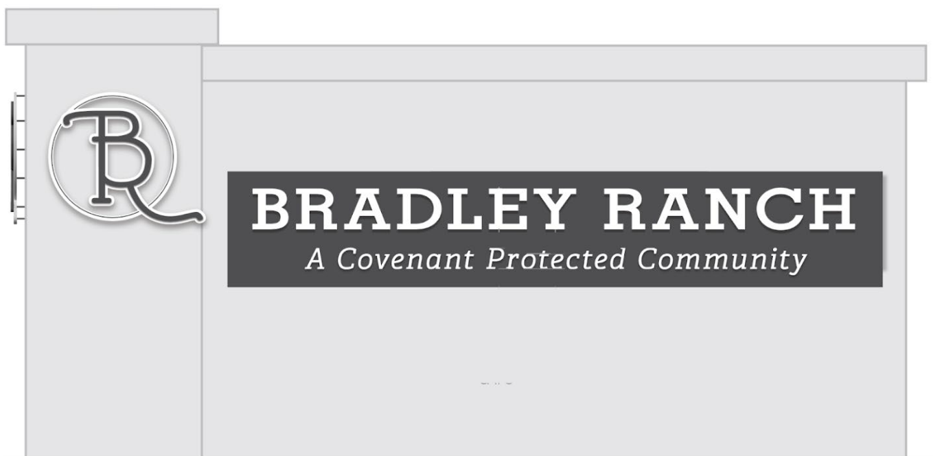
Figure 1: Basic Rendering of Monument Sign

Many of you may have noticed a community sign is under construction at the community's entrance on Tochal. It should be noted that the sign has the statement "A Covenant Protected Community". This is to highlight that Bradley Ranch has standards and rules that each homeowner has agreed to abide by upon purchasing their home. Below is a basic rendering of the sign. The wording and logo are metal, but the rest of the sign is stone.