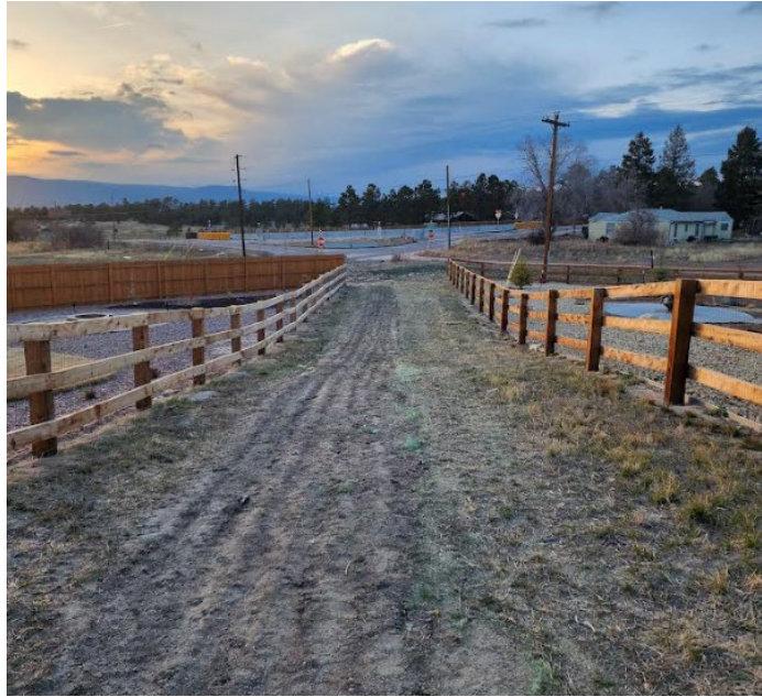
Figure 2: Site for path linking Wrangell Circle to N Union Blvd

A path will be added to the community to connect Wrangell Circle to N Union Blvd. The new path will be completed before the end of the summer.